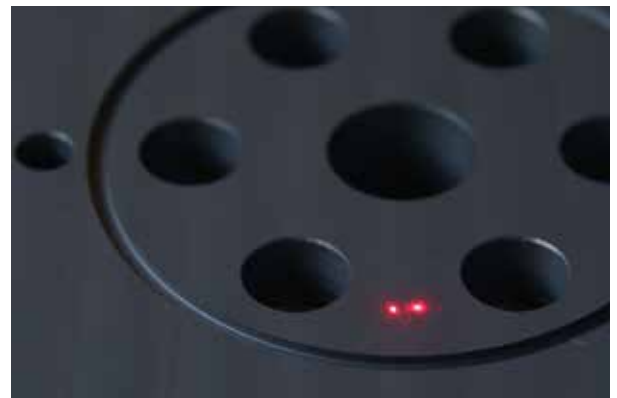
Twin beams for easy focus finding