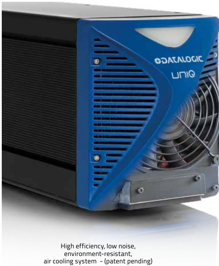
High efficiency, low noise, environment-resistant, air cooling system - (patent pending)

Laser interaction with organic or inorganic material can cause TOXIC FUMES/PARTICLES. The OEM laser components described in this product guide is for sale solely to qualified manufacturers, who shall provide interlocks, indicators and other appropriate safety features in full compliance with applicable national and local regulations.