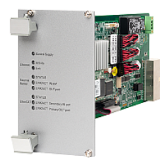
Motion controller module