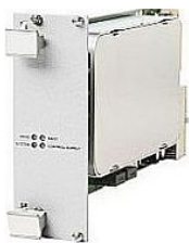
2-axis drive module

The user can select the power supply configuration, the type of each of the four drive modules, its current and which voltage (48Vdc or 96Vdc) to feed it and a motion controller and EtherCAT master. Consult ACS for availability.