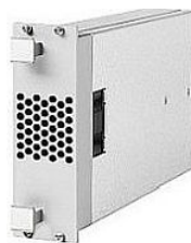
Power supply module