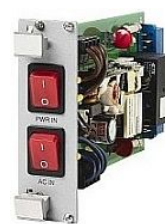
Power management module