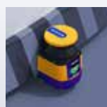
Safety Laser Scanner