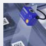
Stationary Industrial Scanners